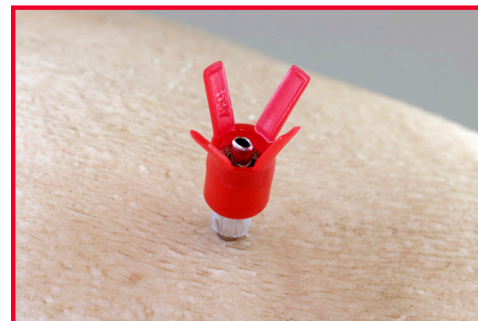
Broken needle with extraction collar in an animal