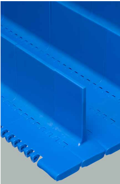
S800 HEAVY-DUTY EDGE IN PK